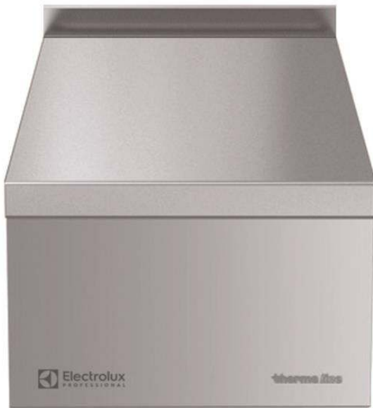
588563 (MBNABDDOOO) Closed Work Top, one-side operated with backsplash